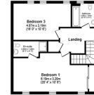
Second Floor Floor area 51.2 m 2 (551 sq.ft.)