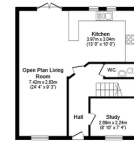
Ground Floor Floor area 51.2 m 2 (551 sq.ft.)